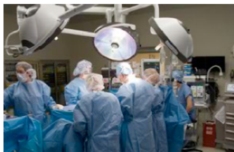
procedures last year.